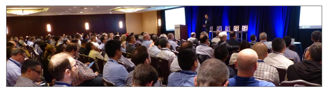
Page 1 of 5

For more information, see <a href="https://www.STACresearch.com">www.STACresearch.com</a> or contact <a href="mailto:council@STACresearch.com">council@STACresearch.com</a>.